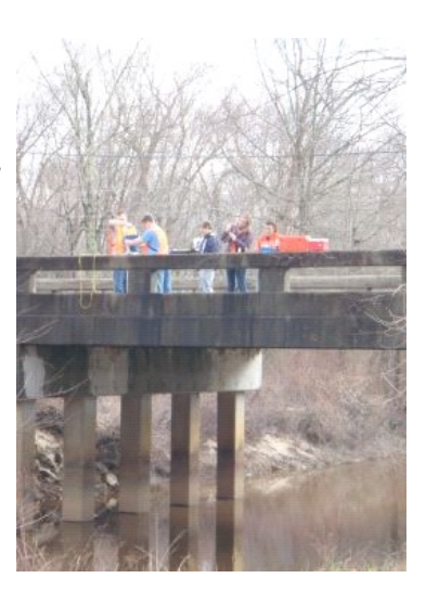
CBGS students testing the water quality of Cat Point Creek