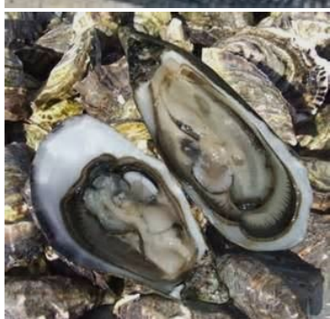
Oyster Gardening— Preserving A NNK Heritage & Protecting our Waters