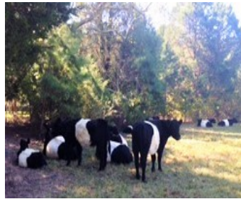
Belted Galloway cattle are now being raised at Ditchley

Ditchley also has abundant natural resources. The site has 2 miles of pristine, deep water frontage on Dividing Creek, Prentice Creek and the Chesapeake Bay. The untouched beauty and abundance of wildlife associated with undeveloped areas of the Chesapeake Bay is stunning.