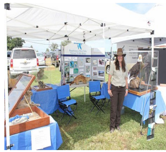
Above-Rap. Wildlife Refuge Exhibits . Below—Jr. Volunteers help with transport