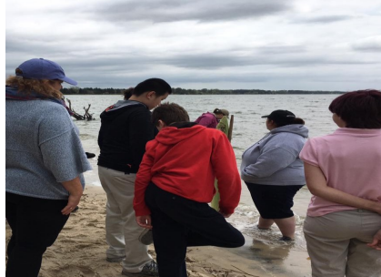
Right- Think Outside the Sink event with area 6th graders Belle Isle