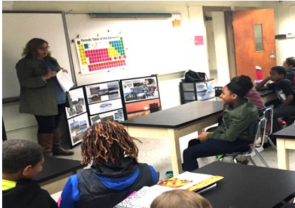
Left- Teaching at Lancaster Middle School

The NNLC Board's 2016 Strategic Plan put forth new and innovative ideas for conservation, education and financial sustainability. Land conservation efforts are proceeding well. NNLC has also tripled youth education efforts by joining "A River Runs Through Us" team teaching sixth graders about the local environment. NNLC also participated in an unprecedented number of community events like Farmer's Markets and historic tours. Financially, we have been successful with our Vision 2020 outreach and grants, but there is much work still to ensure financial sustainability for the future of the NNLC.