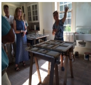
Restoration efforts continue at Ditchley under current owners.

Ditchley is listed on the National Register of Historic Places and is a wonderful example of a working plantation from the Colonial Period.