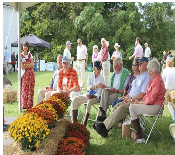
Above- Speakers under the tent Below-Oysters are served!

Great speakers, 20 environmental booths, the Conservation Champion award, a raffle drawing that included a stand up paddle board and "Virginia Adventures" all made the day very special.