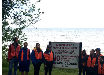
Right-Fossil Hunt at Stratford Hall with Ches. Bay Gov. School students