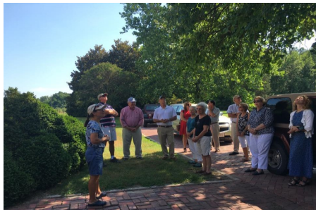
Left - Ditchley tour