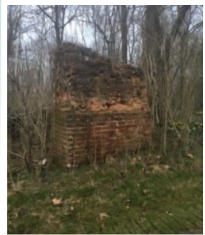
Wind Farms-686 Acres