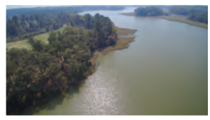
Totuskey Creek- 224 Acres