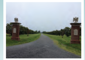
Gascony- 242 Acres