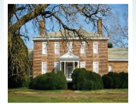
Ditchley- 167 Acres