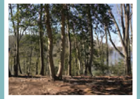
Mill Creek-44 Acres